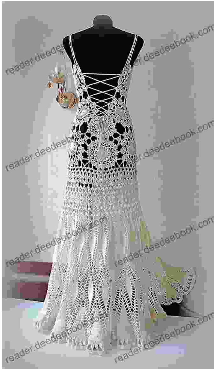
Handmade Heirloom Décor

Crochet gowns offer endless design possibilities. Whether you envision intricate lace patterns, delicate beading, or flowing silhouettes, a skilled crochet artisan can bring your dream dress to life. The soft, ethereal nature of crochet makes it perfect for creating romantic and timeless bridal attire.