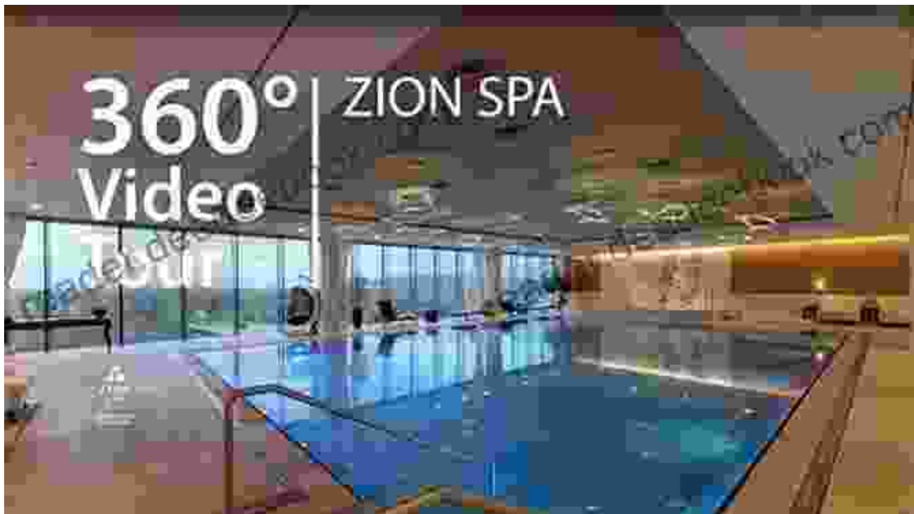
Image of the Hotel Zion

Photograph of the Hotel Zion, a grand and enigmatic building reminiscent of a labyrinth.