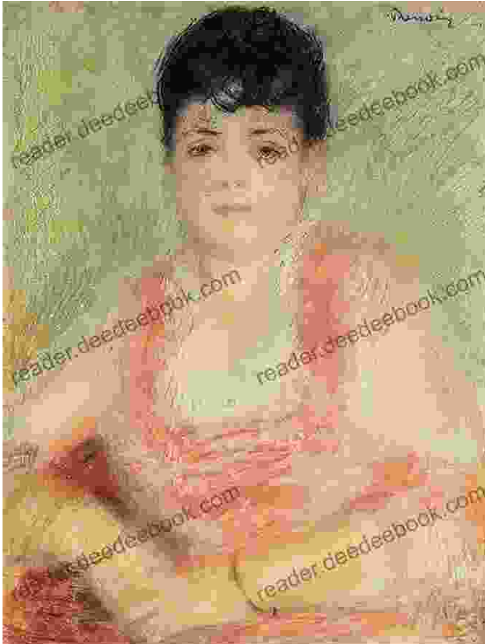
The Pink Dress (1881) by Pierre-Auguste Renoir