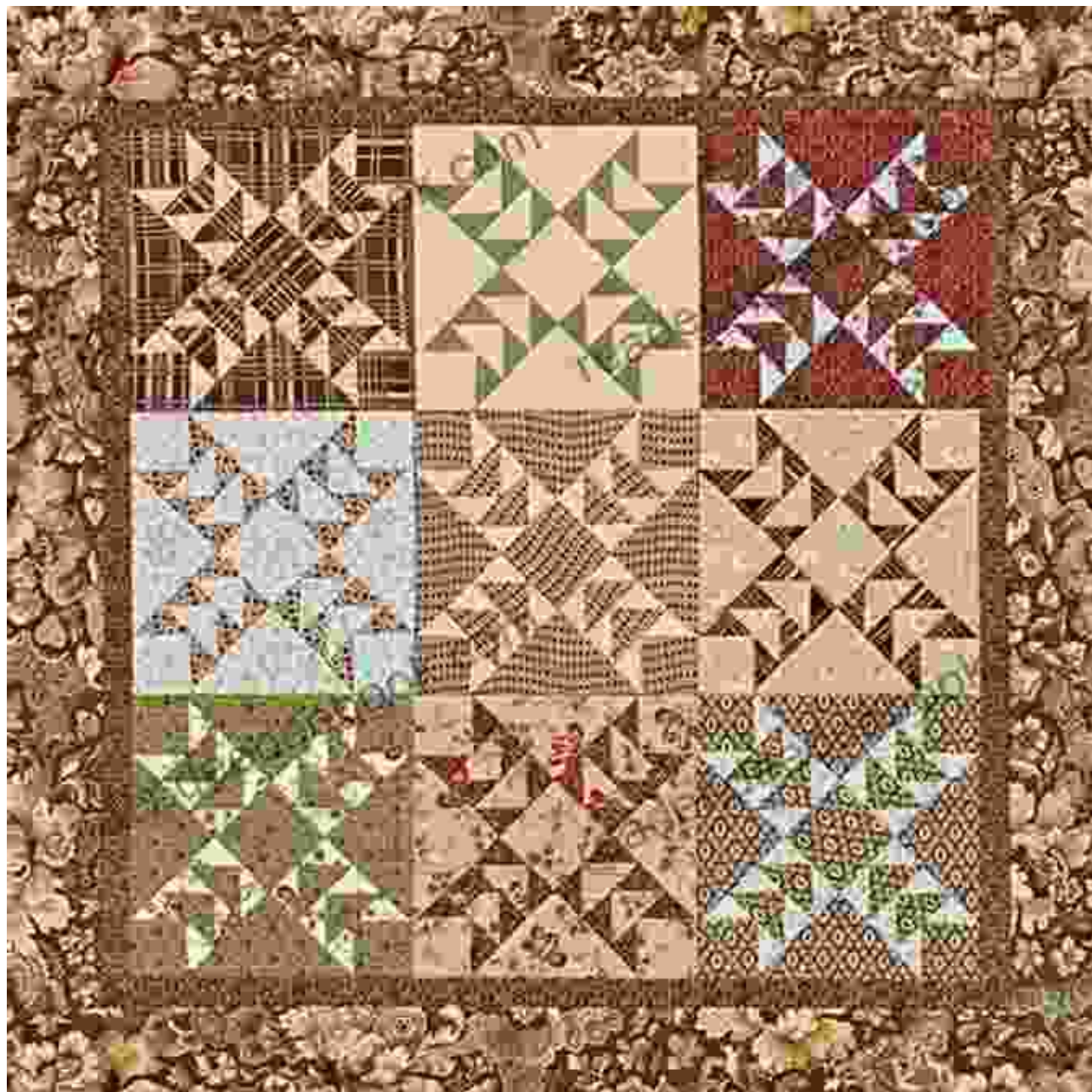
Figure 2: An applique quilt showcases the intricate beauty of Dresden Plate patterns combined with the vibrant colors of Civil War fabrics.