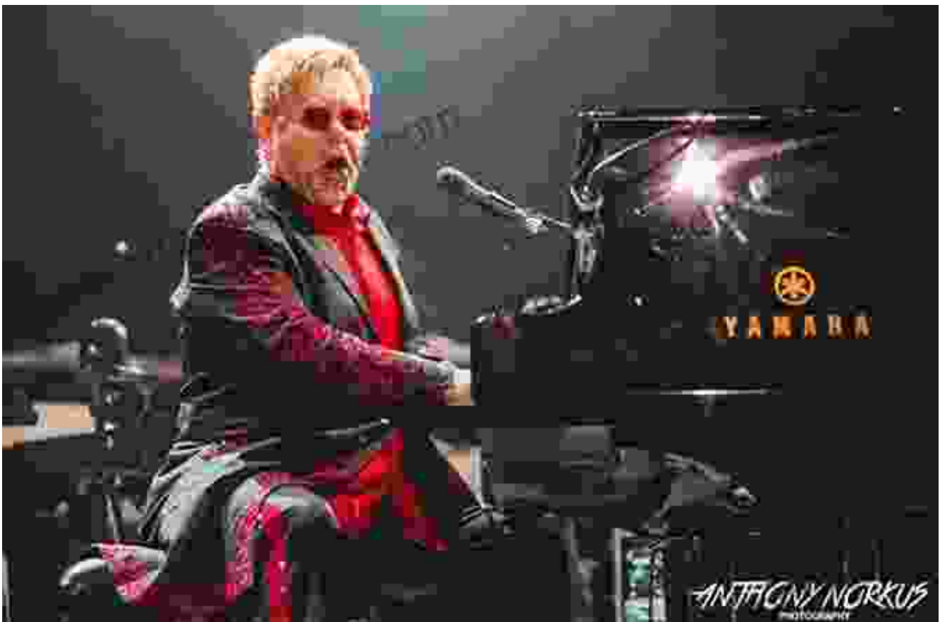
Elton John playing the piano in concert.

John is widely regarded as one of the greatest musicians of all time. He has been praised for his songwriting skills, his piano playing, and his flamboyant stage persona. He is a true icon of the music world, and his music has touched the lives of millions of people around the globe.